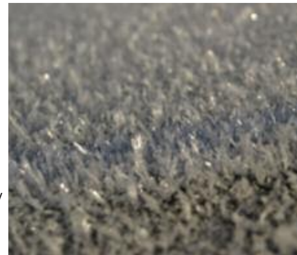
Cover image: Still from A Space Exodus , a video by Larissa Sansour.