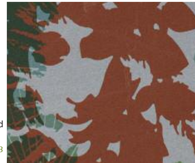
Cover image: A selection of Planet covers through the decades.