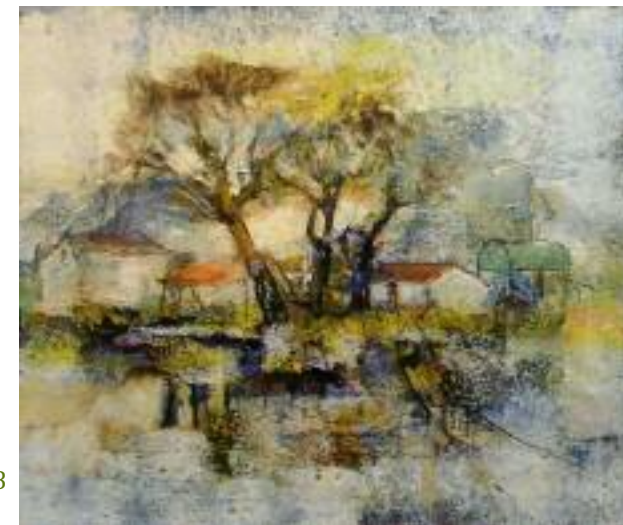
Cover image: Dryad , acrylic and mixed media on canvas. A new painting by Elizabeth Haines. Back: Images from Chapter Arts Centre's archive, including an installation by Alan Goulborne (top).