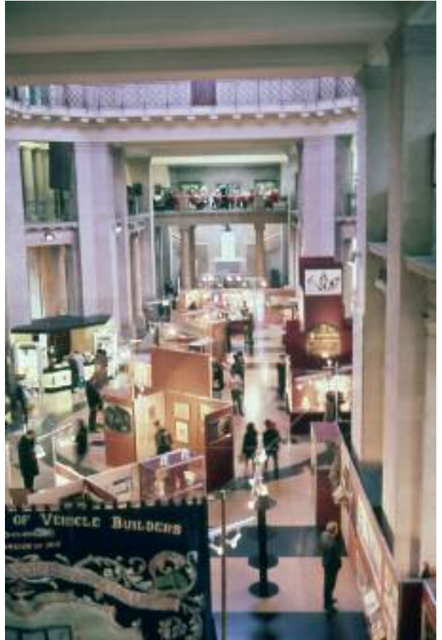
The WORK exhibition at the National Museum of Wales. A works band plays on the balcony.

War was followed by three equally successful Art and Society exhibitions on the themes: Work , Worship and Love and Marriage (originally called Sex but changed after complaints from schools and churches). The first of these included a remarkable set of lantern slides produced by the pioneering documentary photographer William Jones showing working conditions in Welsh mines in the early-1900s. It was the only exhibition in the series to include a substantial amount of Welsh material. In an article in Planet (issue 9, 1971), Ken Baynes said he was against the idea that “all the Council’s money should be used to promote Welsh art,” claiming it