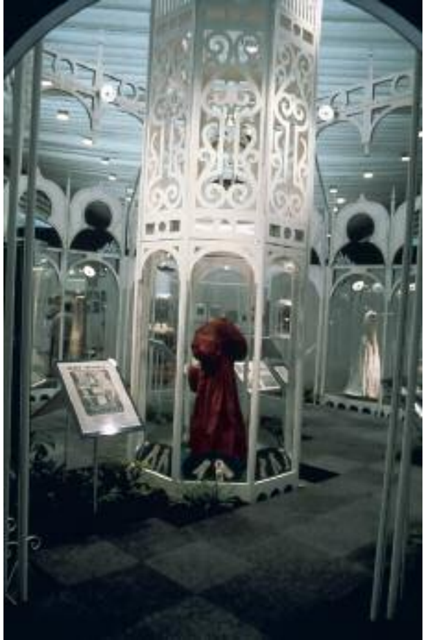
Part of the LOVE AND MARRIAGE exhibition.