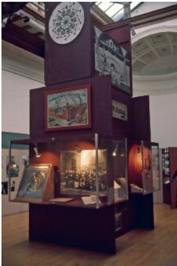
The WORK exhibition at the Glynn Vivian Art Gallery in Swansea.